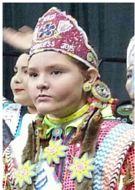
NOBLEE LITTLE DOG